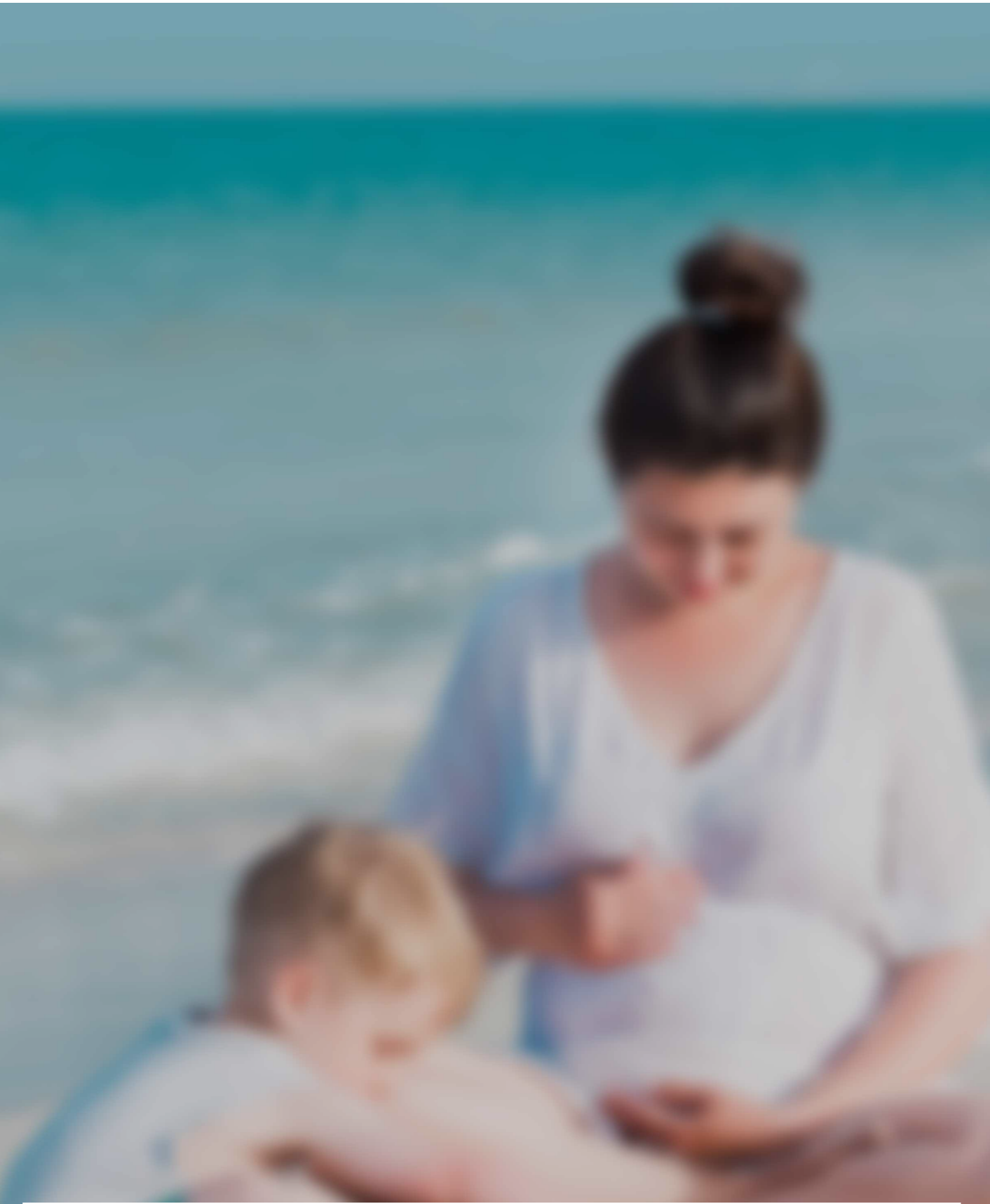
MOMMY & KIDS