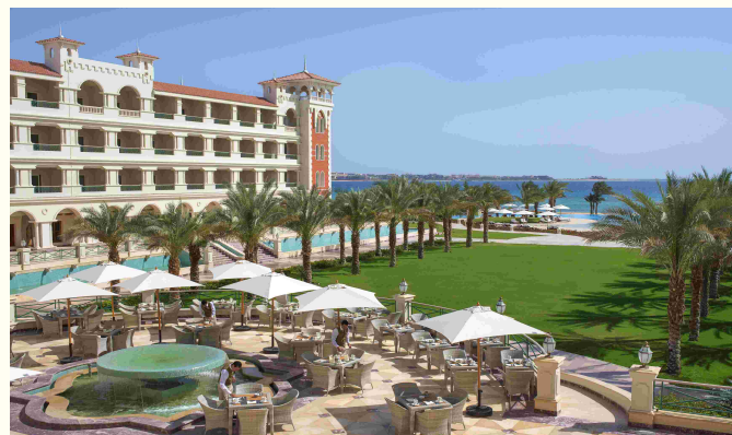
Botanicals are the boundary between luxury and pleasure