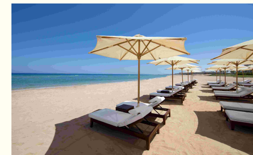
The luxurious Palace offers the ultimate in tranquility