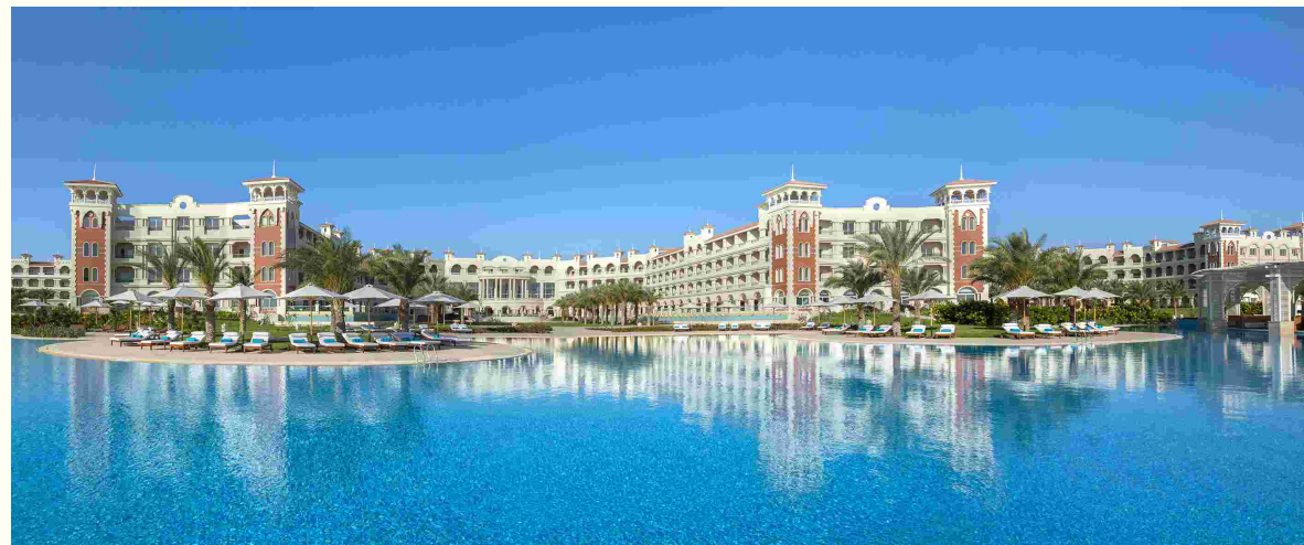
Palace of luxury and welfare