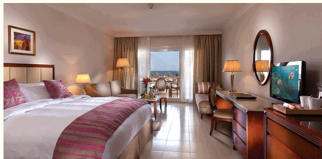
Double bedroom with glamorous views of the Red Sea