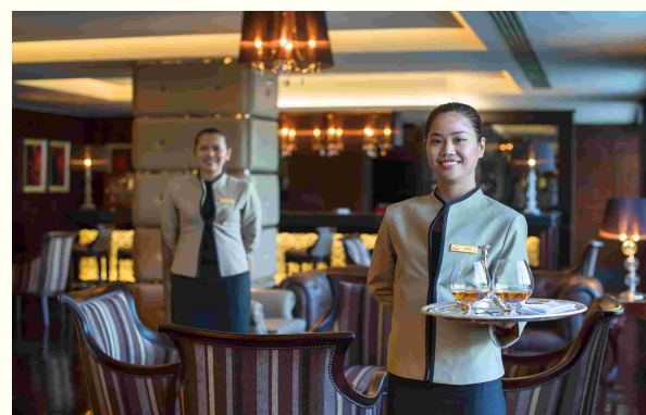
Traditional Arabic Palace design