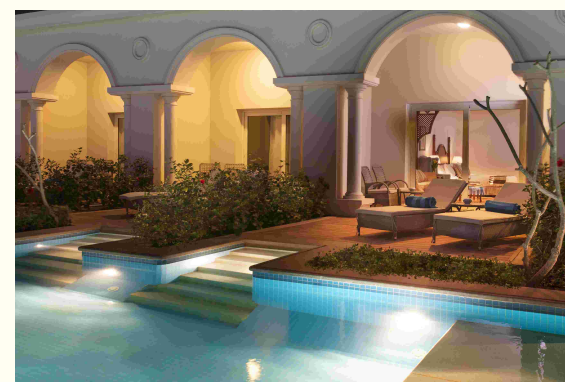
Experience luxury glamor at the Palace