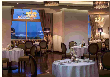
All day restaurant serving the finest delicacies

The total number of rooms & Suites is 615 (427 with sea view, 33 with a private swimming pool and sea views, and 155 with garden view). All rooms are equipped with 32-inch LCDTV and another is the bathrooms of the royal suites, all with satellite channels (more than 50 international channels) and wireless internet access (including all public areas). Exclusive amenities will be used to all rooms, while 24-hour butler service will be provided at royal suites.