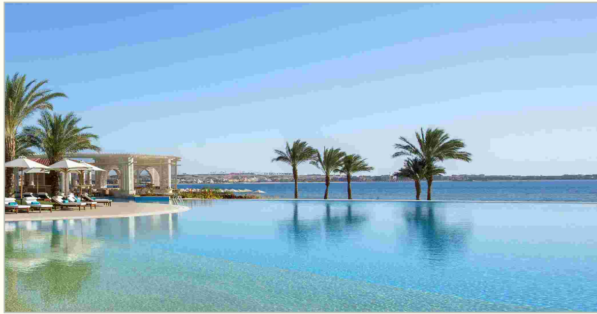
Infinity pools seem to cascade into the red sea