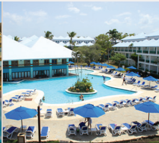
GRAND PARADISE PLAYA DORADA