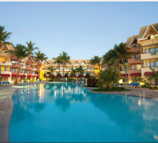
CASA MARINA BEACH & REEF