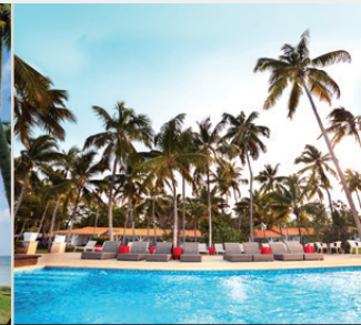
SELECT AT GRAND PARADISE SAMANA