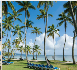
GRAND PARADISE SAMANA