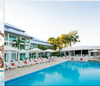
SELECT AT GRAND PARADISE PLAYA DORADA

WE ARE THE LARGEST "GENUINELY" DOMINICAN HOTEL CHAIN THAT MANAGES RESORTS ACROSS THE COUNTRY UNDER THE ALL INCLUSIVE CONCEPT SINCE MAY 2000.